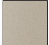
Marvail Beige 1